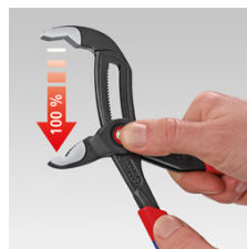
Press the button – open pliers completely