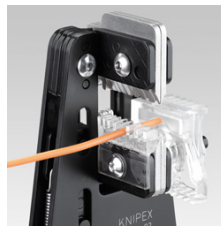
12 12 02 with cable guide and length stop