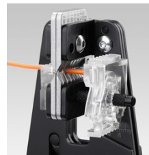
Precise cutting of the insulation to a complete extent