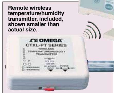
CTXL-TRH-W9 temperature/humidity recorder with remote wireless transmitter, shown smaller than actual size.

Battery Life: 1 year typical, at 1 minute transmission rate Receiver Computer Interface: USB, to change receive interval, frequency and channel ID