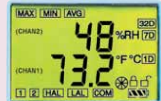
CTXL-TRH—Temperature/Humidity Local Display