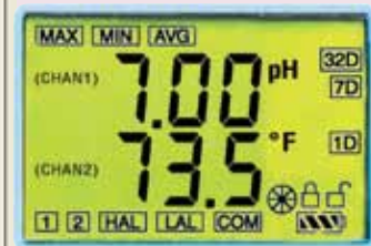
CTXL-PH—pH & RTD Local Display