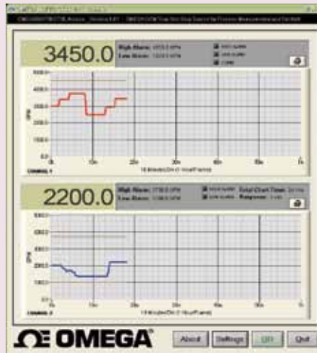
CTXL-DPR PC Application

Battery Status: Indicator on LCD; shows 100, 75%