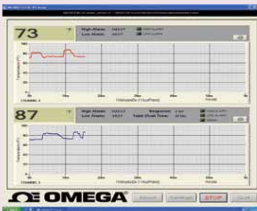
CTXL-DTC PC Application