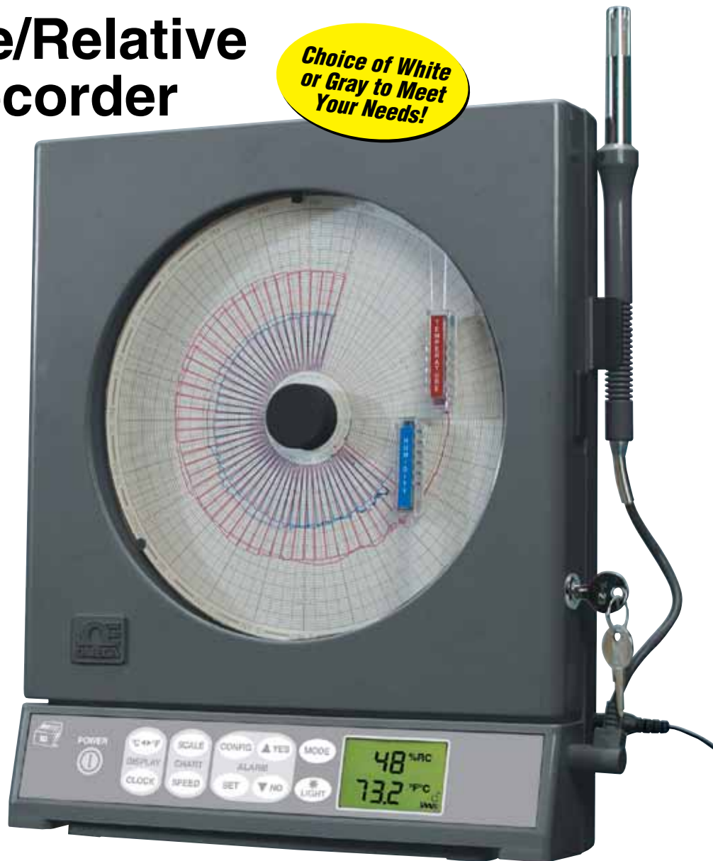
CTXL-TRH recorder, shown smaller than actual size.