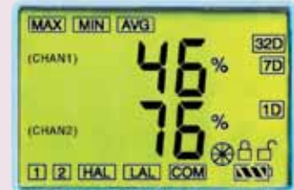
CTXL-DPR—Dual Process Local Display