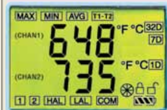
CTXL-DTC—Dual Thermocouple Local Display

Serial PC Communications: RS232, 2-way, 9600 baud