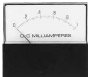
Type 251 and 255 Horizon Line