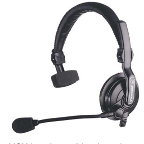
VOX headset with microphone