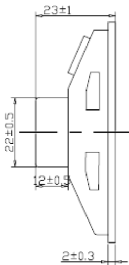
Dimensions : Millimetres Tolerance: ±0.5mm