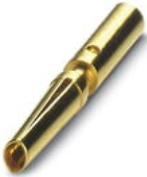
Crimp contact, turned, Contact diameter: 0.8 mm, Crimp range: 0.08 mm 2 ...0.25 mm 2

Please be informed that the data shown in this PDF Document is generated from our Online Catalog. Please find the complete data in the user's documentation. Our General Terms of Use for Downloads are valid ( http://phoenixcontact.com/download )