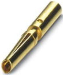
Crimp contact, turned, Contact diameter: 0.8 mm, Crimp range: 0.34 mm 2 ...0.5 mm 2

Please be informed that the data shown in this PDF Document is generated from our Online Catalog. Please find the complete data in the user's documentation. Our General Terms of Use for Downloads are valid ( http://phoenixcontact.com/download )