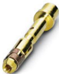
Crimp contact, turned, Single contact, Contact diameter: 1 mm, Crimp range: 0.5 mm 2 ...1 mm 2

Please be informed that the data shown in this PDF Document is generated from our Online Catalog. Please find the complete data in the user's documentation. Our General Terms of Use for Downloads are valid ( http://phoenixcontact.com/download )