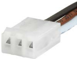
Wire Harness Wire harness for SCHURTER products