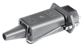
Cord retaining kits Cord retaining strain relief