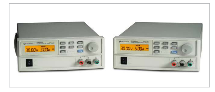
Figure 1. The U8001A 90 W and U8002A 150 W single output DC power supplies