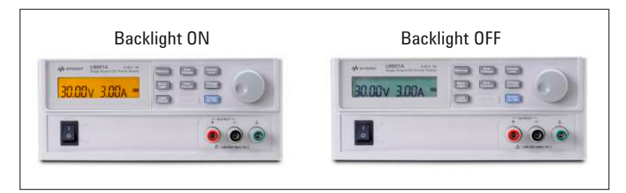
Figure 2. Backlight on/off options for LCD display