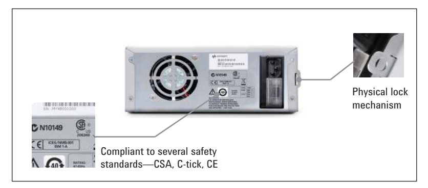
Figure 3. Safety and security features of the U8000 Series single output DC power supplies