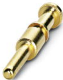
Crimp contact, turned, Contact diameter: 2 mm, Crimp range: 0.25 mm 2 ...1 mm 2

Please be informed that the data shown in this PDF Document is generated from our Online Catalog. Please find the complete data in the user's documentation. Our General Terms of Use for Downloads are valid ( http://phoenixcontact.com/download )