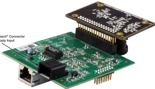
Figure 2: Qorivva MPC5604E Kit (bottom angle)

J3 - BroadR-Reach® Connector with Power Supply Input