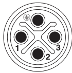
Connector pin assignment of M12 plug, 4-pos., S-coded, view of pin side