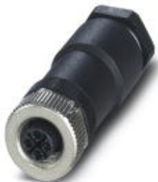
Connector, 4-position, Socket straight M12, S-coded, Screw connection, Knurl material: Zinc die-cast, nickel-plated, Cable gland Pg11, External cable diameter 8 mm ... 10 mm

Please be informed that the data shown in this PDF Document is generated from our Online Catalog. Please find the complete data in the user's documentation. Our General Terms of Use for Downloads are valid ( http://phoenixcontact.com/download )