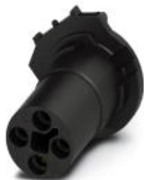
Flush-type connector, Universal, 4-position, SocketLink:straight, T power, PCB mounting, THR solder connection

Please be informed that the data shown in this PDF Document is generated from our Online Catalog. Please find the complete data in the user's documentation. Our General Terms of Use for Downloads are valid ( http://phoenixcontact.com/download )