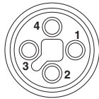
Connector pin assignment of M12 socket, 4-pos., T-coded, view of socket side