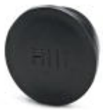
Plastic dust protection cap, anti-static, for RF, SF series connectors, with M23 external thread

Plastic anti-static dust protection cap - RC-Z2469 - 1611797