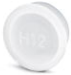
Plastic dust protection cap for connectors with M23 external thread

Plastic dust protection cap - RC-Z2059 - 1604225