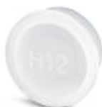
Plastic dust protection cap for connectors with M23 external thread

Plastic dust protection cap - RC-Z2059 - 1604225