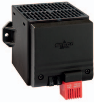
CSF 028 with screw mount tabs