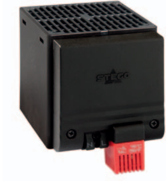
CSF 028 with DIN clip