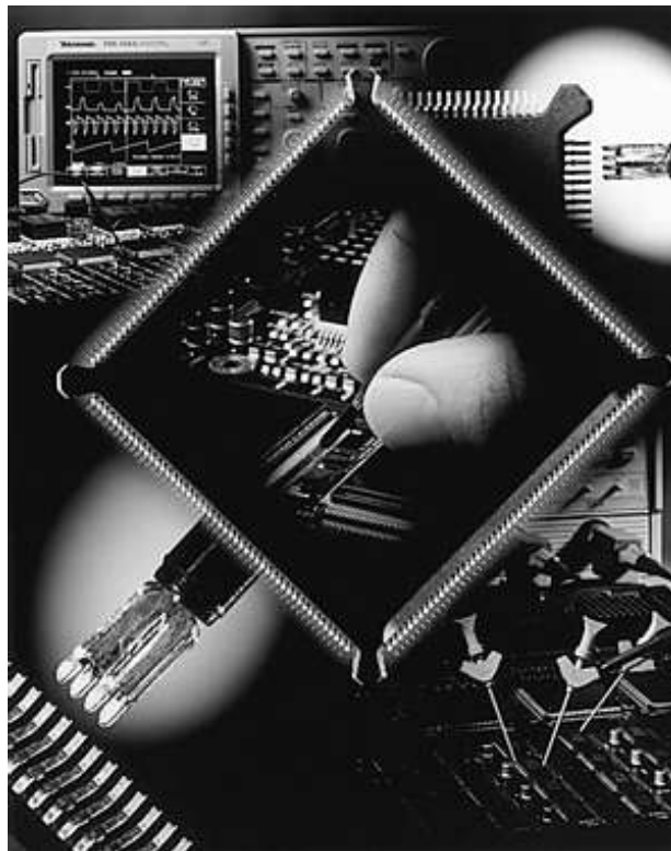
SureFoot SF Series.