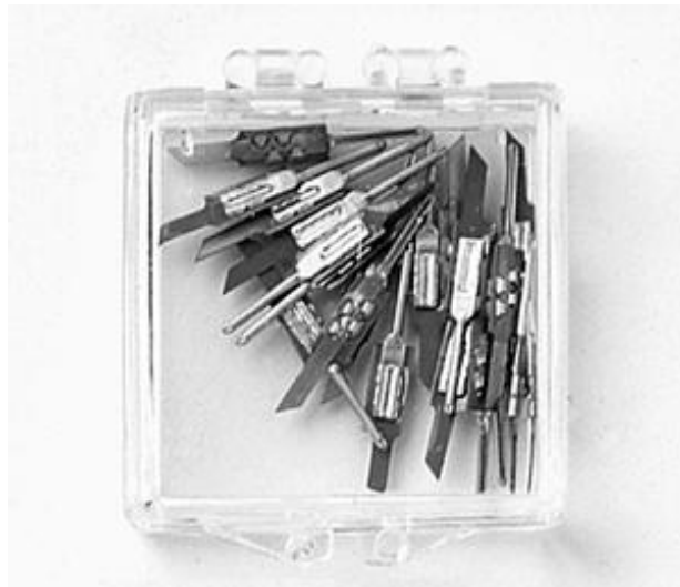
SureToe Adapter (ST501).