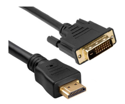
HDMI to DVI lead