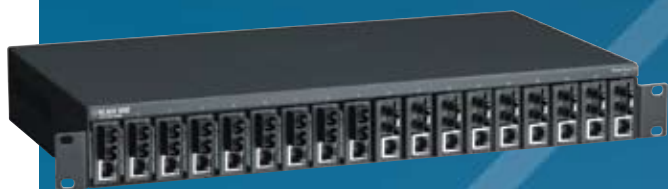
Power Tray (LHC018A-AC-R2) filled with Miniature Media Converters.