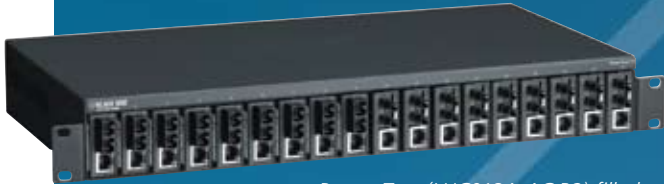
Power Tray (LHC018A-AC-R2) filled with Miniature Media Converters.