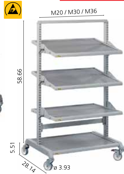
Multi trolley 2