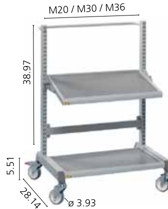
Multi trolley 1

Multi trolleys provide an ergonomic mobile workstation. Multi trolleys are available in three different widths: M20, M30 and M36. This means that all our module-sized accessories can be used with the trolleys. Multi trolleys are equipped with four swivel casters (ø 3.93 inches), two of which have brakes. ESD versions are also available.