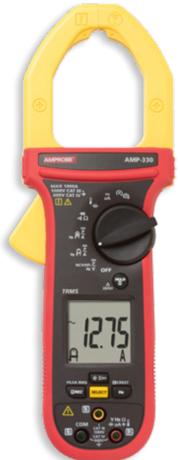
AMP-330 AC/DC 1000 A Clamp Meter Industrial Motor Maintenance