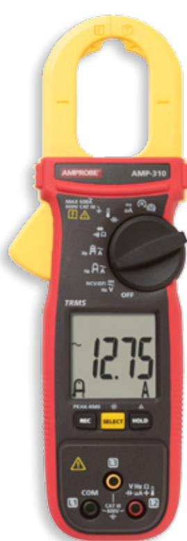
AMP-310 AC Clamp Meter HVAC