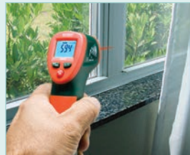
Checking for heat loss around windows and doors