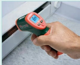
Test for temperature in heating systems