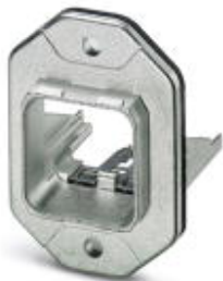
RJ45 panel mounting frame, IP67, for push-pull interlocking, metal, with the Freenet system, for square panel cutout, with grommet, without mounting screws

Please be informed that the data shown in this PDF Document is generated from our Online Catalog. Please find the complete data in the user's documentation. Our General Terms of Use for Downloads are valid ( http://phoenixcontact.com/download )