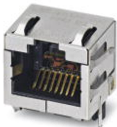
RJ45 socket insert, for PCB assembly, CAT6 A , 8-pos., shielded, with angled solder pins, 1x

Please be informed that the data shown in this PDF Document is generated from our Online Catalog. Please find the complete data in the user's documentation. Our General Terms of Use for Downloads are valid ( http://phoenixcontact.com/download )