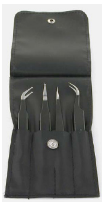
Tweezers Kit with D00831, D00832, D00834, D00836, D00837 (3, 7A, 12SMD, 13SMD)

www.element14.com www.farnell.com www.newark.com www.cpc.co.uk www.mcmelectronics.com