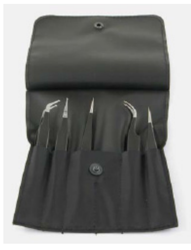
Tweezers Kit with D00831, D00833, D00834, D00836, D00837 (3, 3C, 5, 7A, 12SMD, 13SMD)