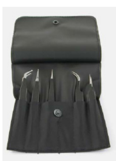
Tweezers Kit with D00831, D00833, D00834, D00836, D00837 (3, 5, 7A, 12SMD, 13SMD)