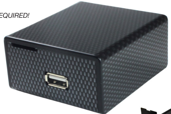
Raspberry Pi A+ not included