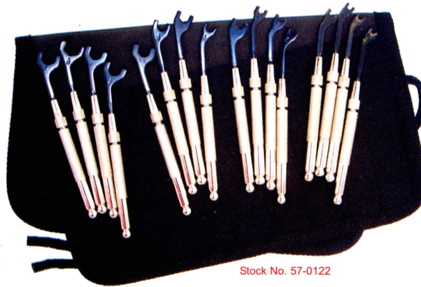
Stock No. 57-0122