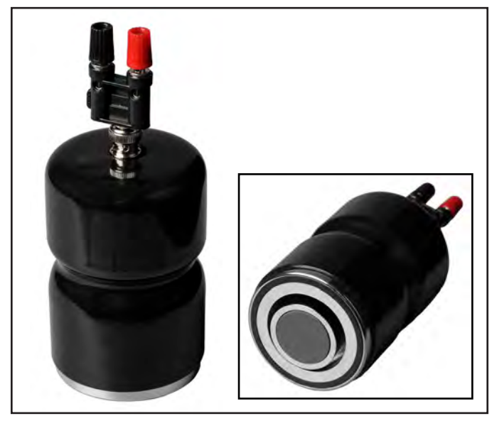
Figure 7. Vermason 222002 Concentric Ring Probe

The Vermason <u>222002</u> Concentric Ring Probe is an instrument to be used in conjunction with a resistance meter, such as the Vermason <u>222643</u> Digital Surface Resistance Meter, to measure surface resistance per EN 61340-5-1 Table 4 Packaging of solid planar materials.