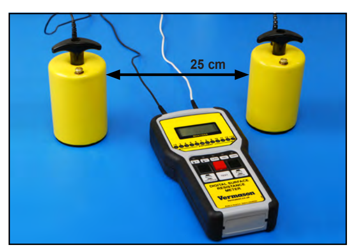
Figure 6. Rp-p test setup - set the electrodes about 25 cm apart for working surfaces and about 1 m apart for flooring

If the measurement is outside acceptable limits, clean the surface with an ESD cleaner containing no insulative silicone such as Reztore™ Antistatic Surface & Mat Cleaner, and re-test to determine if the cause of failure is an insulative dirt layer or the ESD worksurface material.