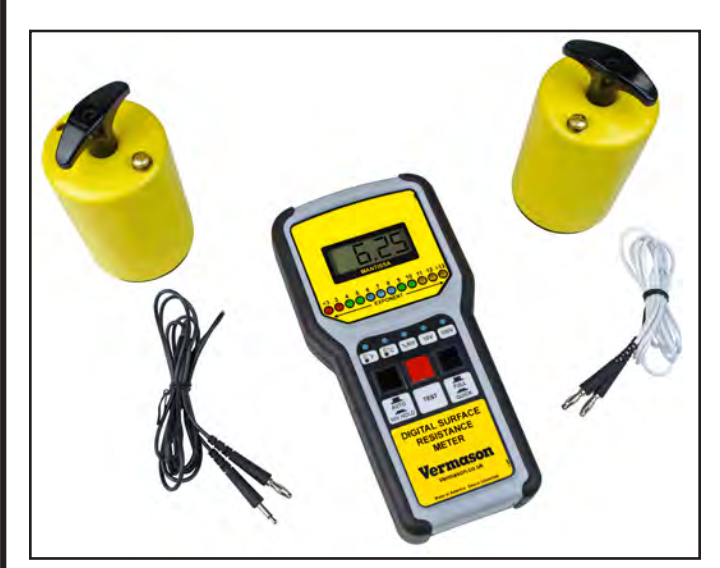
Figure 1. Vermason Digital Surface Resistance Meter Kit