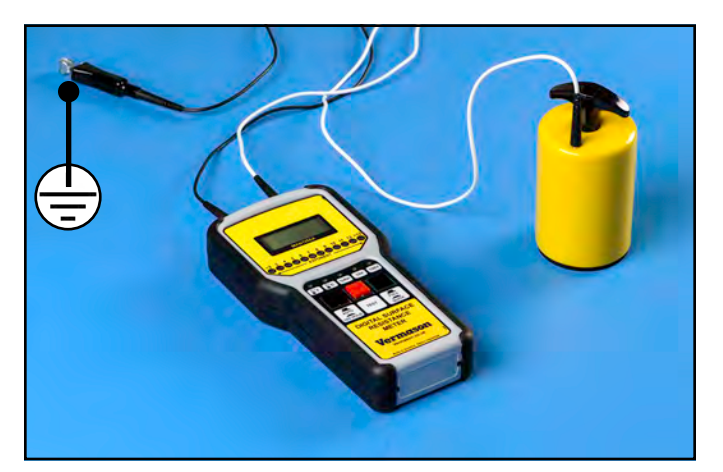
Figure 5. Rg test setup

If the measurement is outside acceptable limits, clean the surface with an ESD cleaner containing no insulative silicone such as Reztore™ Antistatic Surface & Mat Cleaner, and re-test to determine if the cause of failure is an insulative dirt layer or the ESD worksurface material.