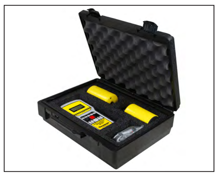
Figure 2. Vermason <u>222642</u> Digital Surface Resistance Meter Kit