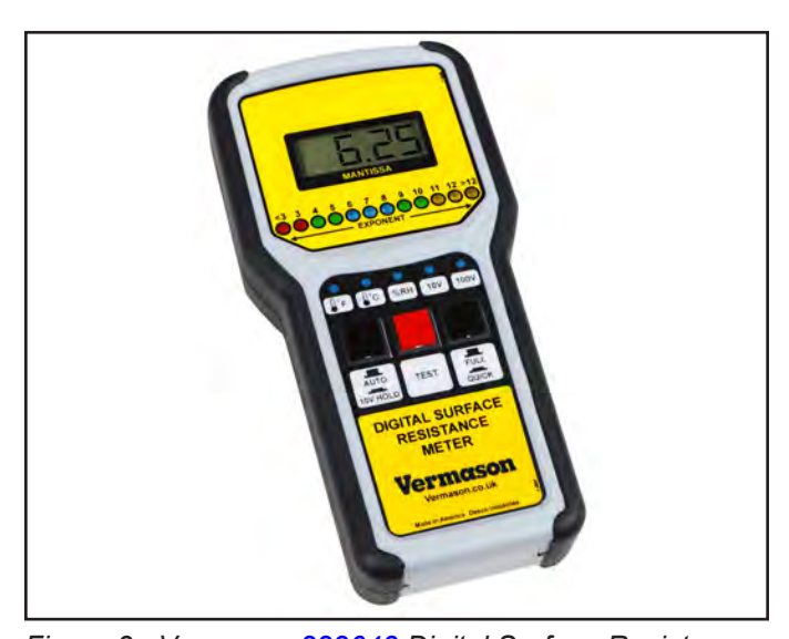
Figure 3. Vermason <u>222643</u> Digital Surface Resistance Meter