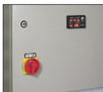
Front view of a cabinet with the display unit, easily visible, mounted on the front of the door, whilst the protector unit is installed deep within