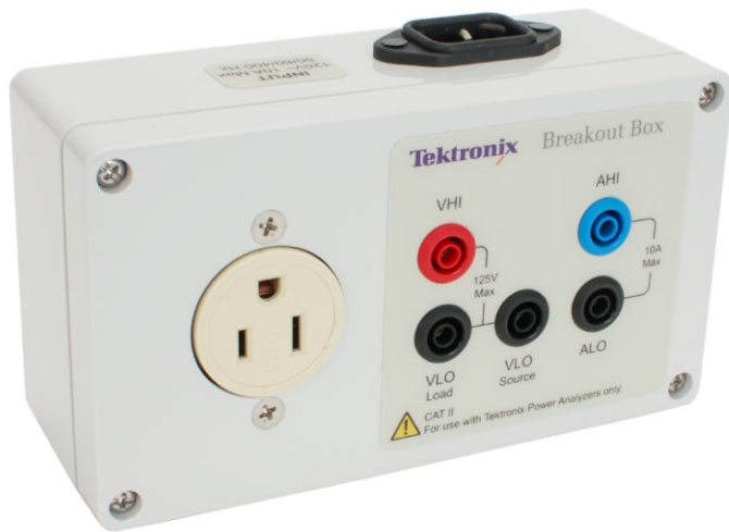
BB1000-NA Breakout Box