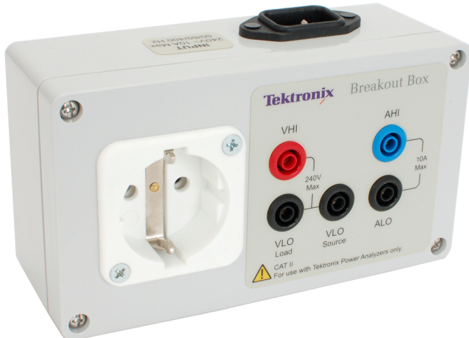
BB1000-EU Breakout Box