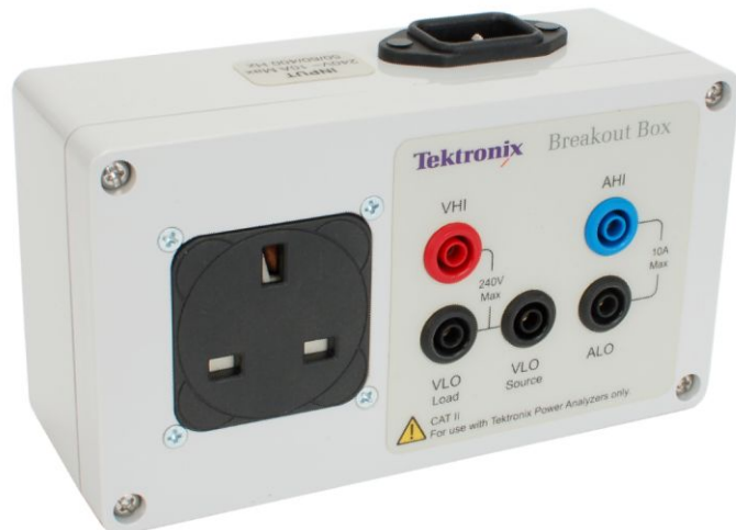
BB1000-UK Breakout Box

The BB1000 Breakout Box makes wiring connections between your device-under-test and Tektronix power analyzers easy and safe, by 'breaking out' the current flow for connection to the internal current shunt in the analyzer. It provides a line output socket to power your device under test (up to 10 A RMS ) and 4 mm sockets for direct connection to the Tektronix power analyzer terminals. The BB1000 Breakout box is offered in three different versions with these receptacle styles: