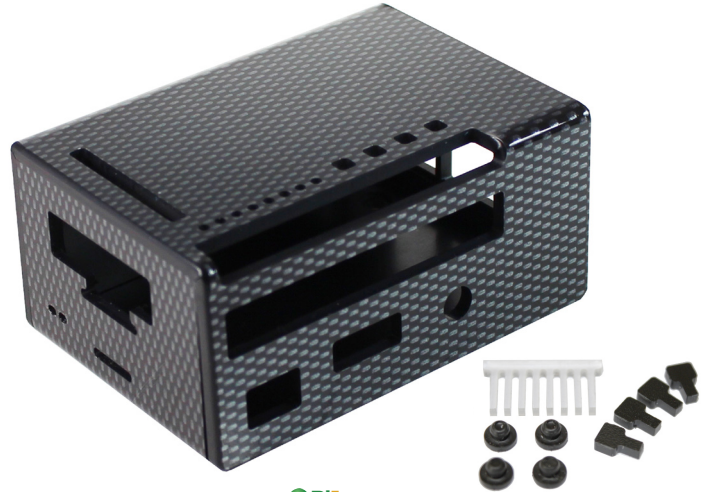
Raspberry Pi B+ and PiFace Digital 2 assemblies not included