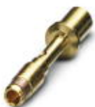
Crimp contact, turned, Single contact, Contact diameter: 2 mm, Crimp range: 0.25 mm 2 ...1 mm 2