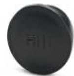
Plastic dust protection cap, anti-static, for connectors with M23 knurled nuts

Plastic anti-static dust protection cap - RC-Z2468 - 1611796