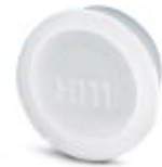
Plastic dust protection cap for connectors with M23 knurled nuts

Plastic dust protection cap - RC-Z2058 - 1604223