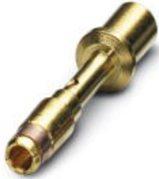
Crimp contact, turned, Single contact, Contact diameter: 2 mm, Crimp range: 0.75 mm 2 ...1.5 mm 2

Please be informed that the data shown in this PDF Document is generated from our Online Catalog. Please find the complete data in the user's documentation. Our General Terms of Use for Downloads are valid ( http://phoenixcontact.com/download )