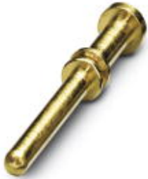
Crimp contact, turned, Single contact, Contact diameter: 2 mm, Crimp range: 0.14 mm 2 ...0.25 mm 2

Please be informed that the data shown in this PDF Document is generated from our Online Catalog. Please find the complete data in the user's documentation. Our General Terms of Use for Downloads are valid ( http://phoenixcontact.com/download )