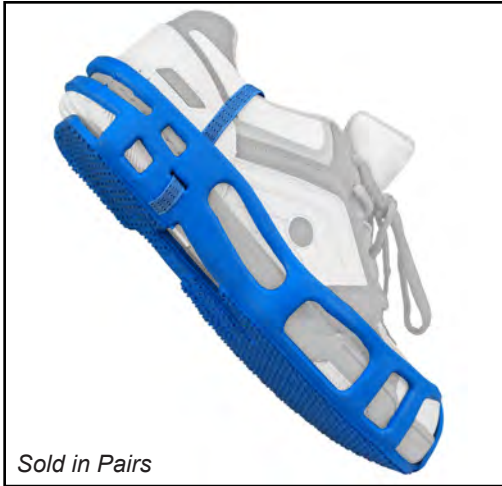
Sold in Pairs