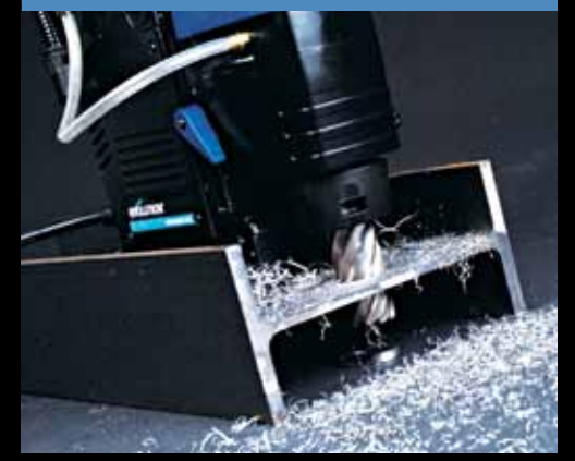
Ideal For: BRIDGES • I-BEAMS • FRAMEWORK