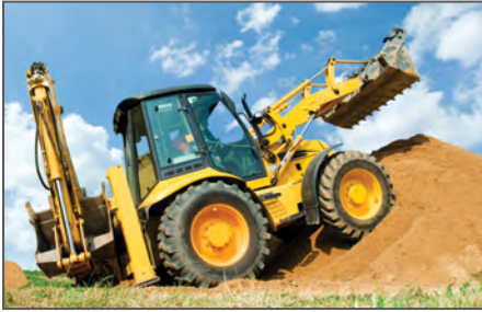
Construction Machinery & Equipment