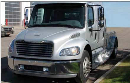
Truck / Lorry