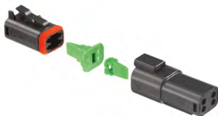
4-Circuit ML-XT Connector System