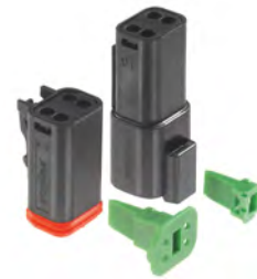
4-Circuit ML-XT™ System