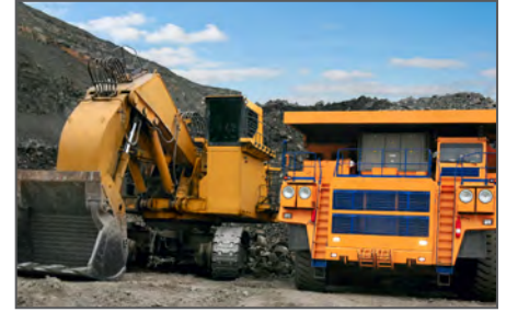
Mining Machinery & Equipment