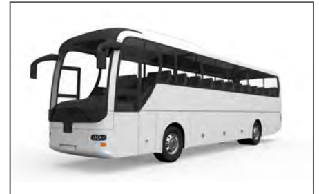
Bus / Coach