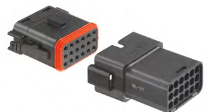
18-Circuit ML-XT Connector System