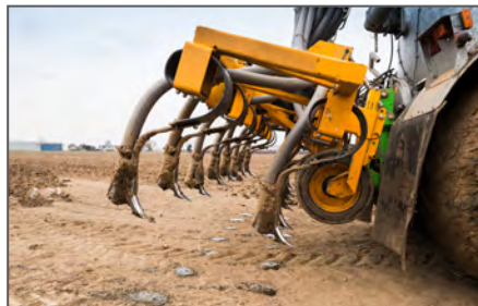
Agricultural Machinery & Equipment