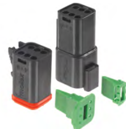
6-Circuit ML-XT™ System