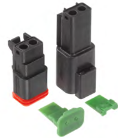
2-Circuit ML-XT™ System