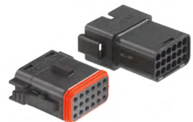
18-Circuit ML-XT™ System