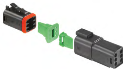
6-Circuit ML-XT Connector System