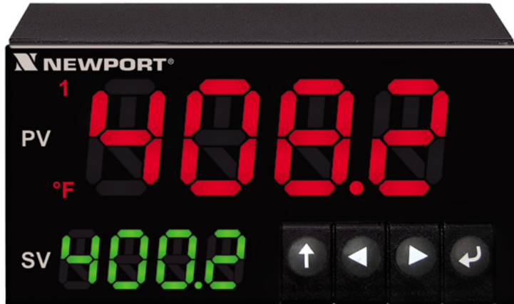
Pt8D Series shown actual size.