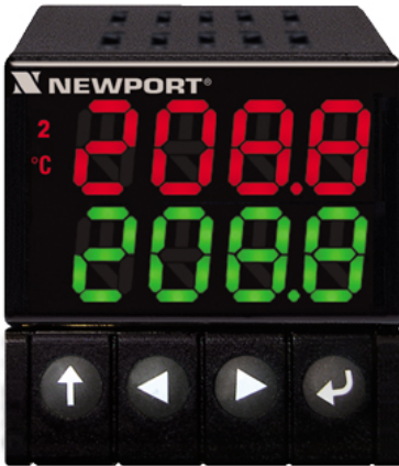
Pt16D Series shown actual size.

Industry Leading Performance...and Easy to Use