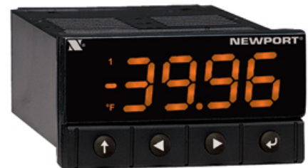
Pt32 Series shown actual size.