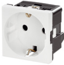
Power - sockets

FrontCom® Vario integrates multiple functions in only one single frame. The system is easy to install and you can select from a wide range of data, signal and power modules. In addition to being extremely compact, FrontCom® Vario offers a number of unique product features that will make your project planning and work activities secure, fast and future-proof. Furthermore, the FrontCom® Vario system has an attractive housing design that, by the way, offers highest impact-resistance and fully meets the requirements of IP 65 protection class.