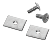
Number of Bins to Fit Each Rail Set