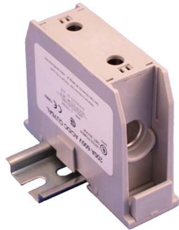
Shown here on Din Rail

Listed Enclosed Power Splicer Block 200 Amps, 600 Volts (AC/DC) 1,000V AC/DC CE (IEC 60947-7-1) DIN Rail mountable on 7.5 x 35 mm rail.