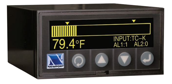
Horizontal bar graph mode.