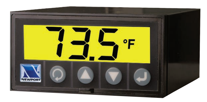
Large digital display mode.

All models shown smaller than actual size.