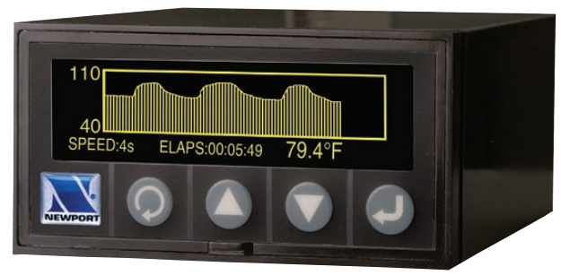
Graphic panel meter shown in line graph charting mode.

With Optional Alarm Relays, Isolated Analog Output, 24 Vdc Excitation Voltage, and Wireless Receiver