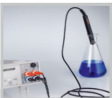
Temperature measurement HZ887 in combination with HM8112-3

Accuracy, HZ812 in combination with HM8012: -50°C < T° < 200°C ±(0.2% of reading + 0.25°C) 200°C < T° < 400°C ±(0.2% of reading + 0.45°C)