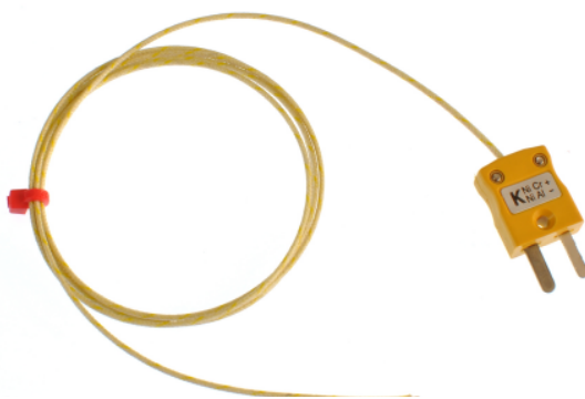
Types K with 're-wireable' miniature flat pin plug

Technical support is always freely available from our experienced technical sales teams and the company has ISO9001 accreditation.