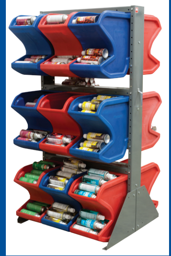
Hanging bins on the Floor Rack saves valuable space.