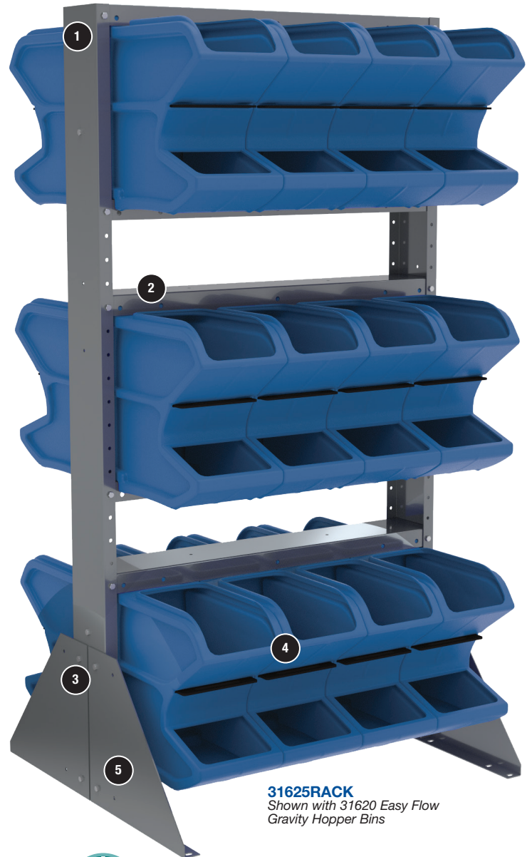
31625RACK Shown with 31620 Easy Flow Gravity Hopper Bins