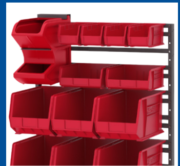
Optional bracket allows bins to hang on existing louvers panels or racks.