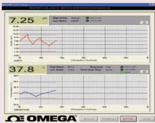
CTXL-PH PC Application