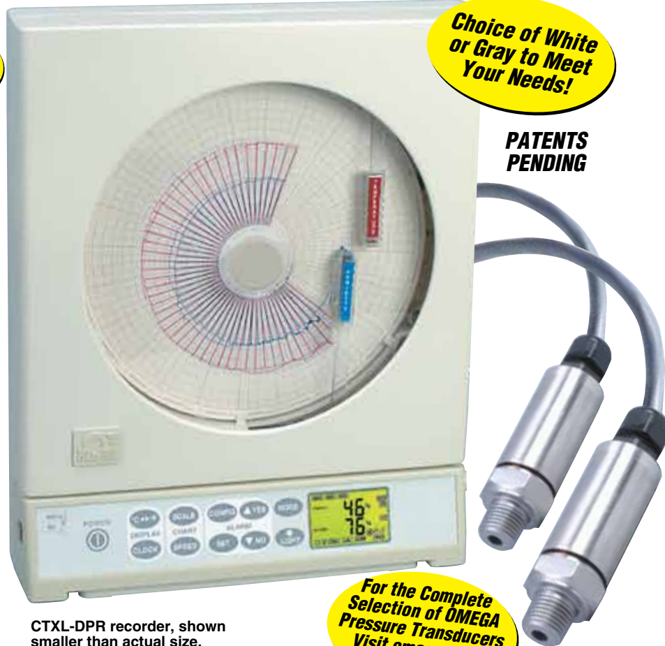
CTXL-DPR recorder, shown smaller than actual size.

For the Complete Selection of OMEGA Pressure Transducers Visit omega.com/px309